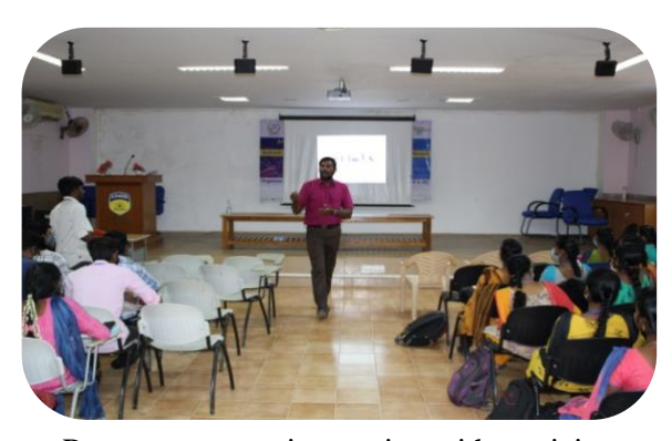
Resource person interacting with participant