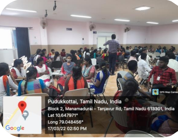
Resource person conducting games