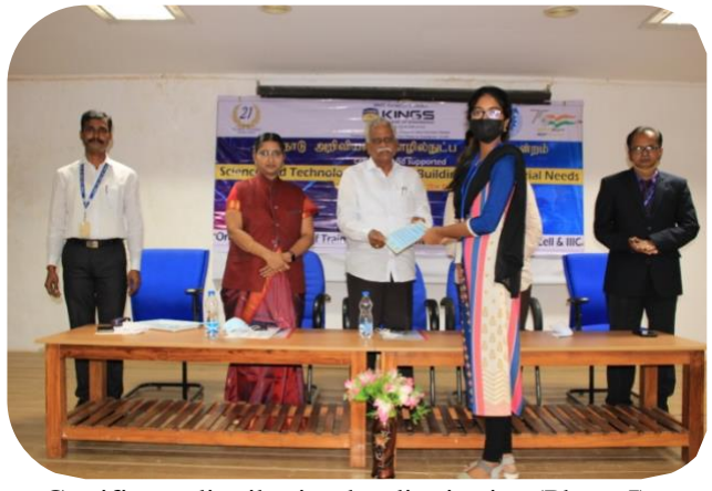
Certificate distribution by dignitaries (Phase I)