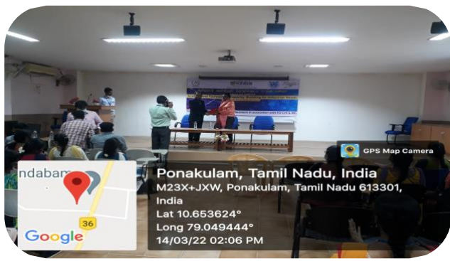
Resource Person honoring by vice Principal