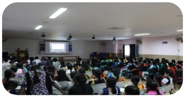
Resource person from ICT academy delivering address