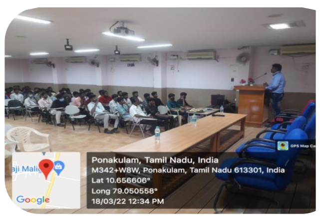
Resource person addressing on ICT in industries