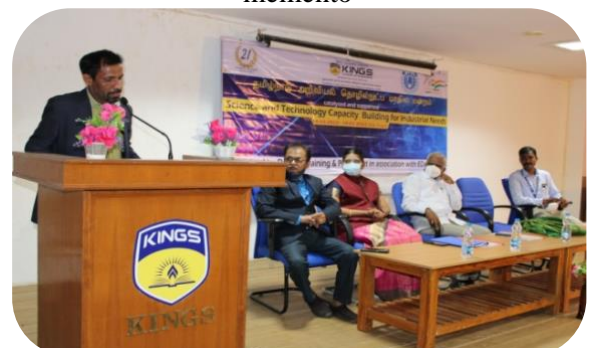
Chief guest giving his inaugural address