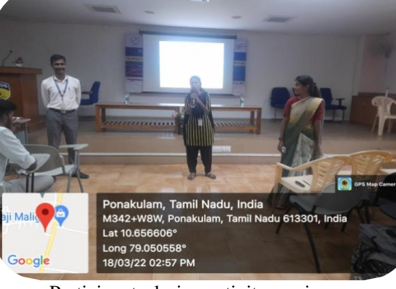
Our Proud alumni giving her talk on 'Taste of English'