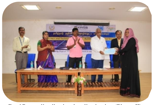
Certificate distribution by dignitaries (Phase II)