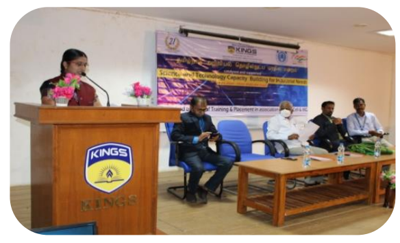
Principal giving felicitation address