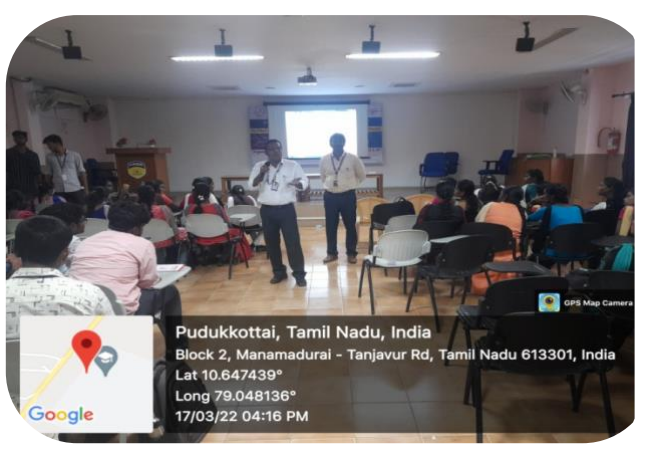
Resource Person during the lecture session