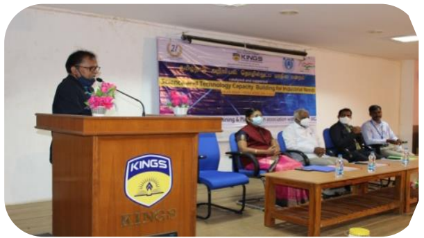
Vice Principal welcoming the gathering